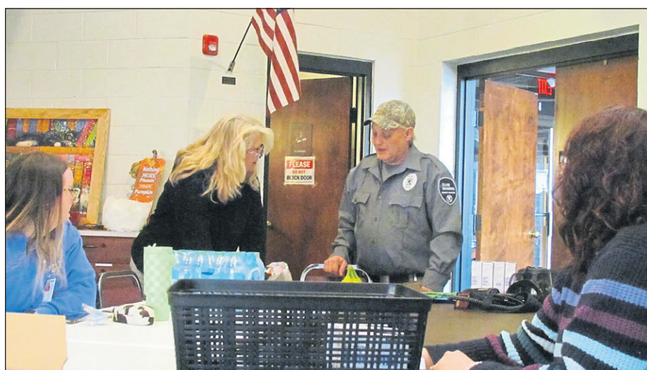
ALEXA BLACK | Herald Ledger

Narcan is considered to be easy to use, effective and safe, even in the event that it is used on someone in which opioids are not present in the bloodstream. Small doses of it are administered through a single spray in the nostril, similar to a nasal spray. Depending on how serious the overdose and potency of the opioid, more doses of Narcan