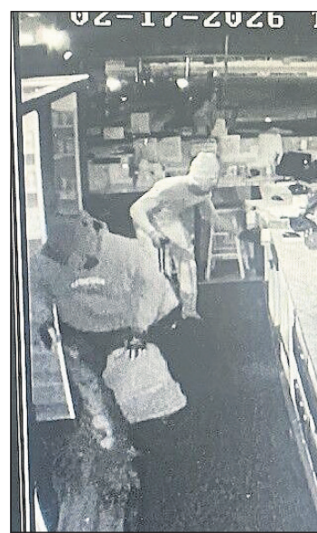
Lyon County Sheriff's Office

The deputy's investigation found that two unidentified perpetrators forcibly entered McConnell Health Mart Pharmacy on Cedar Street, doing damage to a door before trying to steal items within the business.