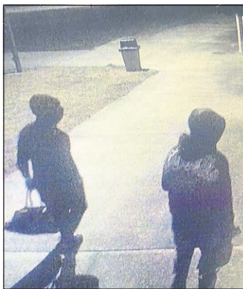
Lyon County Sheriff's Office

Anyone with information about the alleged burglary may contact Lyon County Sheriff's Office.