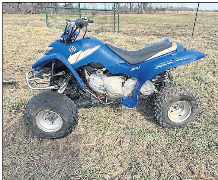
Lyon County Sheriff's Office

The sheriff's office said an ATV was placed in a field in preparation for an auction, where it was stolen.