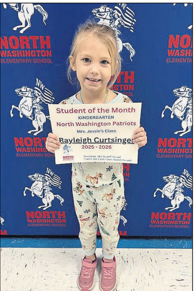
RALEIGH CURTSINGER KINDERGARTEN