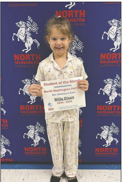
WILLIA DIXON KINDERGARTEN