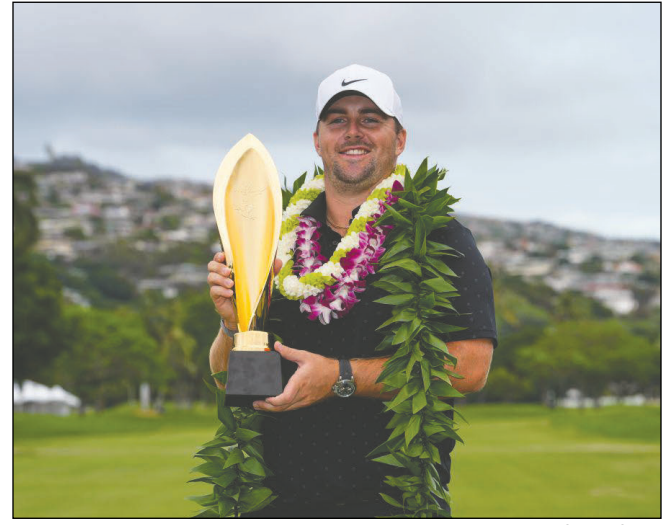
Chris Gotterup reacts after winning the Sony Open golf event at the Waialae Country Club, in Honolulu on Jan. 18.

partners and volunteers across Maui who have supported the event throughout the years," the tour said in a statement.