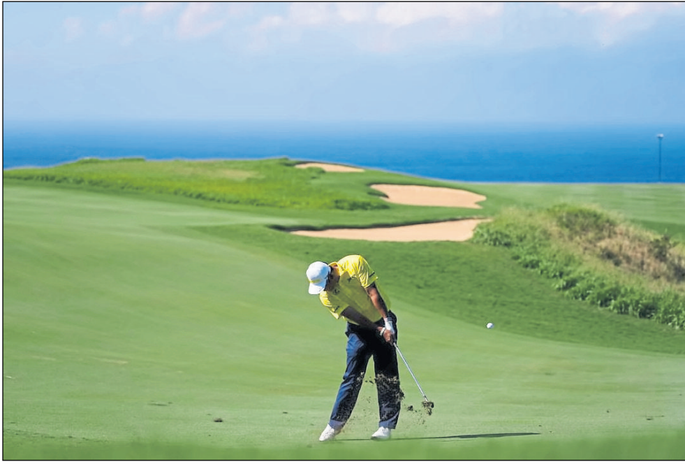
Hideki Matsuyama, of Japan, hits on the 13th hole during the final round of The Sentry golf event on Jan. 5, 2025, at Kapalua Plantation Course, in Kapalua, Hawaii.

"We are grateful to The Plantation Course at Kapalua, Kapalua Resort, Maui County and the state of Hawaii for their longtime support of our season-opening PGA Tour event, as well as the fans,