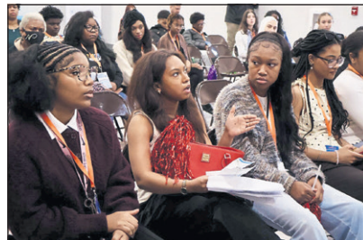
Youth ask questions during Children's Advocacy Day in Frankfort on March 4.