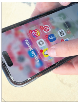
DRAYTON CHARLTON-PERRIN | The Sun

Snapchat is a popular social media platform where the 17-year-old girl alleges her only previous interactions with Dequavion Yarbrough took place.