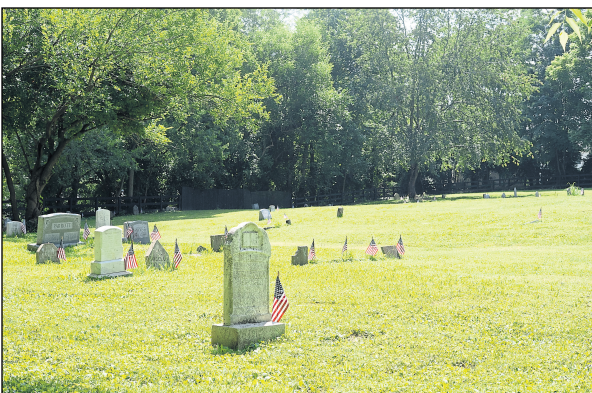
Volunteers placed mini American flags throughout the graveyard.