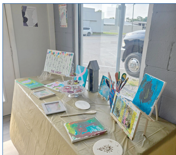
Creative works made by members of The Ability Center were exhibited throughout the front of the facility.