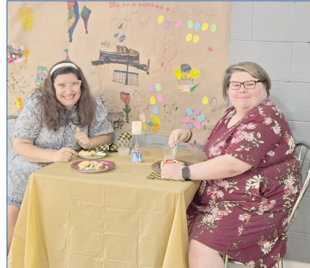
▲ PHOTO | SUBMITTED Individuals from The Ability Center enjoyed an evening with friends and family during the center's inaugural Art Show on May 15.