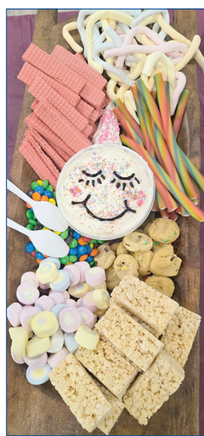
A charcuterie board crafted by a member of The Ability Center was featured among the refreshments served during the event.