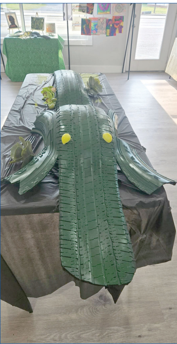
A crocodile sculpture fashioned from an old tire was among the unique creations showcased at the art show.

The evening highlighted the mission of the center, which empowers special needs adults to discover their leadership potential, build confidence and lead their peers each day. Organizers said the event was designed not only to celebrate artistic talent, but also to encourage independence, self-expression and community involvement.