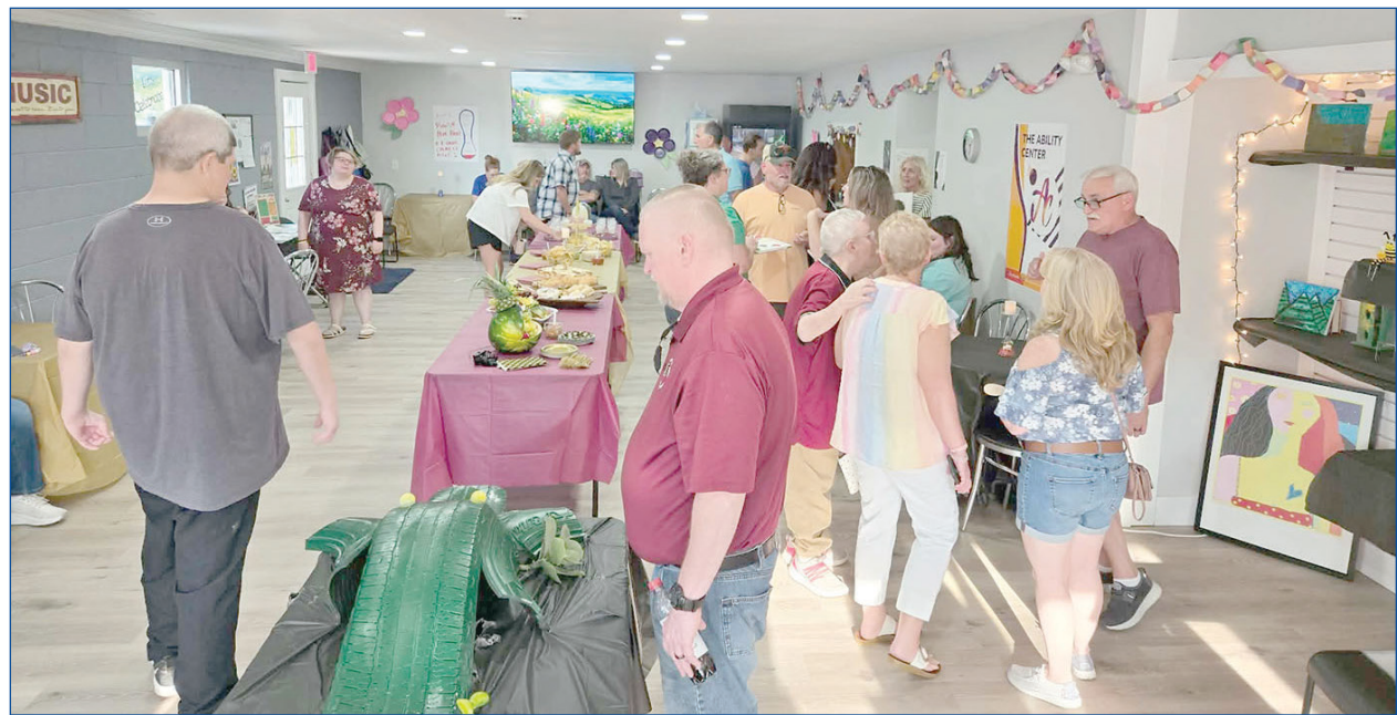
Community members, family and friends attended the inaugural Art Show to support the artists and celebrate their accomplishments.