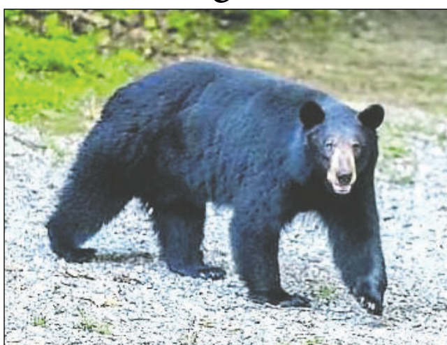
Ryan C. Hermens A black bear is walks near the Salts trailhead at Kingdom Come State Park near Cumberland, Ky. on 2024. A young black bear was spotted in a Lexington neighborhood over the weekend.

Residents can report bear sightings to Kentucky Fish and Wildlife by calling the tip line at 800-858-1549.