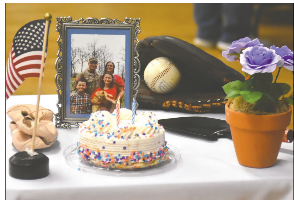
Items ranging from a potted flower to a birthday cake and even a family photo were on display Saturday at the American Legion Post 113 in Elizabethtown following a Military Child's Table Setting Ceremony. Each item on the table represents a special meaning for a military child.