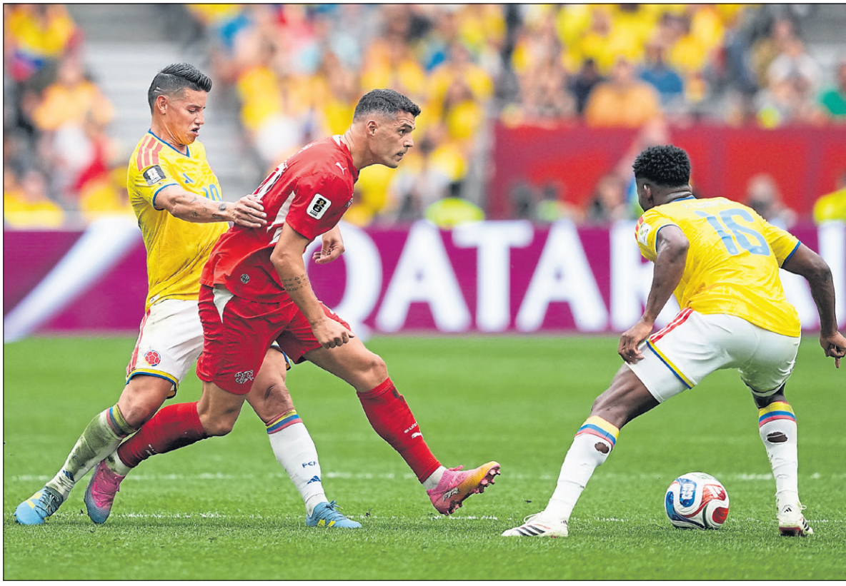
Switzerland's Granit Xhaka, center, tries to get past Colombia's James Rodriguez, left, and Jefferson Lerma during the World Cup round of 16 soccer match between Switzerland and Colombia in Vancouver, British Columbia, on Tuesday.

Colombia defender Davinson Sanchez's penalty attempt hit the crossbar and Switzerland goalkeeper Gregor Kobel saved an attempt by Cucho Hernandez.