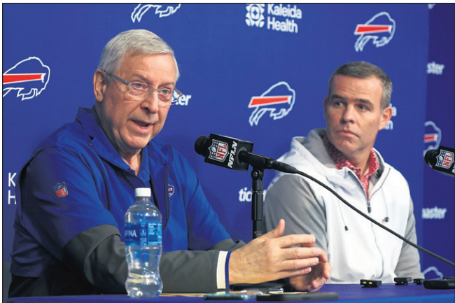
Buffalo Bills owner Terry Pegula left, and General Manager Brandon Beane speak at a NFL football news conference in Orchard Park, N.Y. on Wednesday.

The coaching search process has already started, with the Bills already set to interview several candidates including former Giants coach and former Buffalo’s offensive coordinator Brian Daboll; Com-