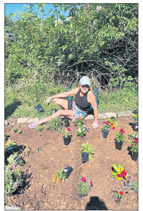
Laurel Oak Garden Club