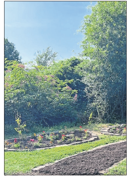
Laurel Oak Garden Club