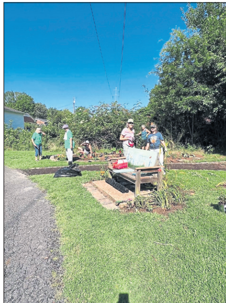
Laurel Oak Garden Club

The Laurel Oak Garden Club recently refurbished the landscaping and butterfly garden at Kess Creek Park, the club announced last week. Members trimmed trees, planted flowers, weeded and laid new mulch. "Laurel Oakers hard at work again!" the club wrote on social media. "Thanks to all who helped."