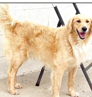
This is Oakley - a 2 year old male Golden Retriever mix.