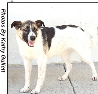
This is Festus - a 1-2 year old male hound mix.