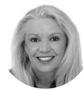
BYEUGENIA LAST Andrews McMeel Syndication