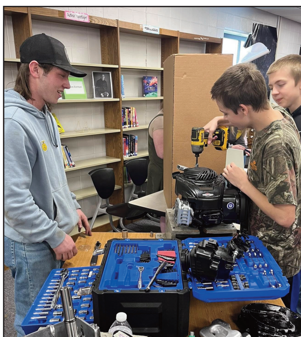
LCCTC students and Lewis County Middle School students prepare these students for their future.

LCMS students pulse like to thank community mem-