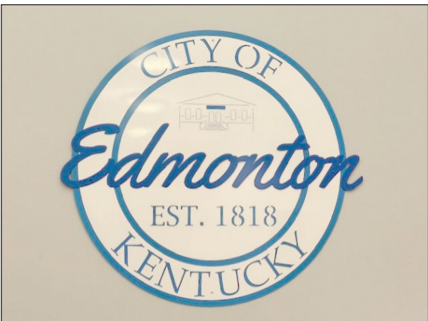
▲ PHOTO | PJ MARTIN These metal wall signs were created by Rece Young for the newly renovated City Hall building.