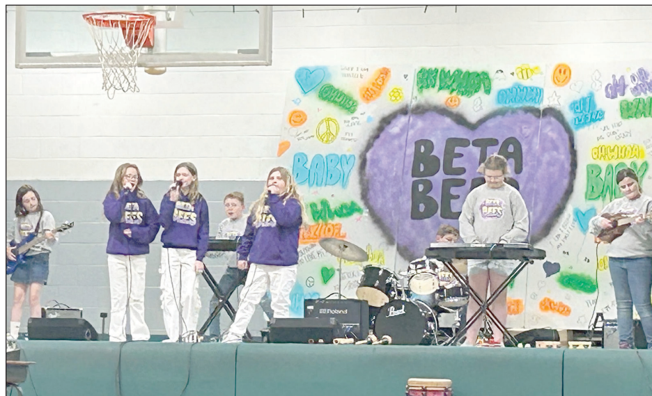
▲ PHOTO | KATRINA ENGLAND Bonnieville's Beta Bees performed for those in attendance.

Condolences may be expressed online at www.brooksfuneralhomeky.com