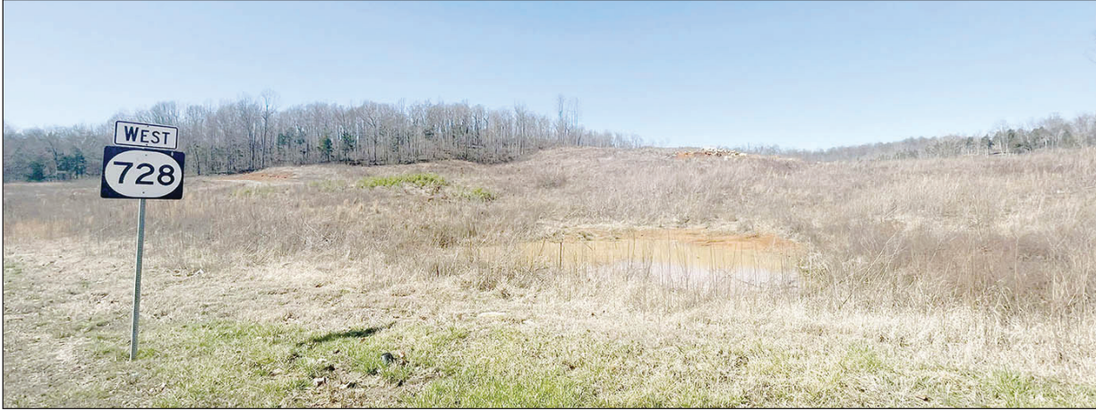
Community Project Funding from the U.S. Department of Housing and Urban Development will be used to help develop a 109-acre tract in Bonnieville into a build-ready industrial site.

notice released by Hart County Fiscal Court, the county plans to request the release of $1 million in Community Project Funding from the U.S. Department of Housing and Urban Development (HUD) to help develop a 109-acre tract in Bonnieville into a build-ready industrial site.