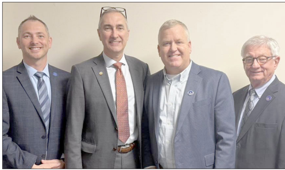
across the Commonwealth in Frankfort through legislative advocacy