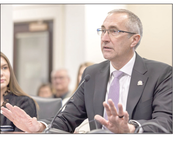
Senate President Pro Tempore David Givens explains Senate Bill 141 to members of the Senate State and Local Government Committee during a Feb. 11 meeting.