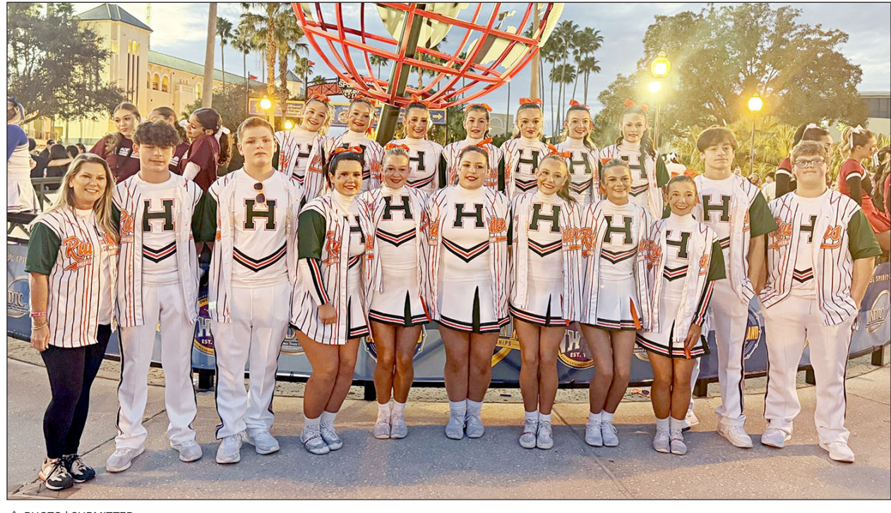
The HCHS Varsity Cheer Team reached the national stage at the UCA National High School Cheerleading Competition. They placed 8th out of 27 teams in the nation.