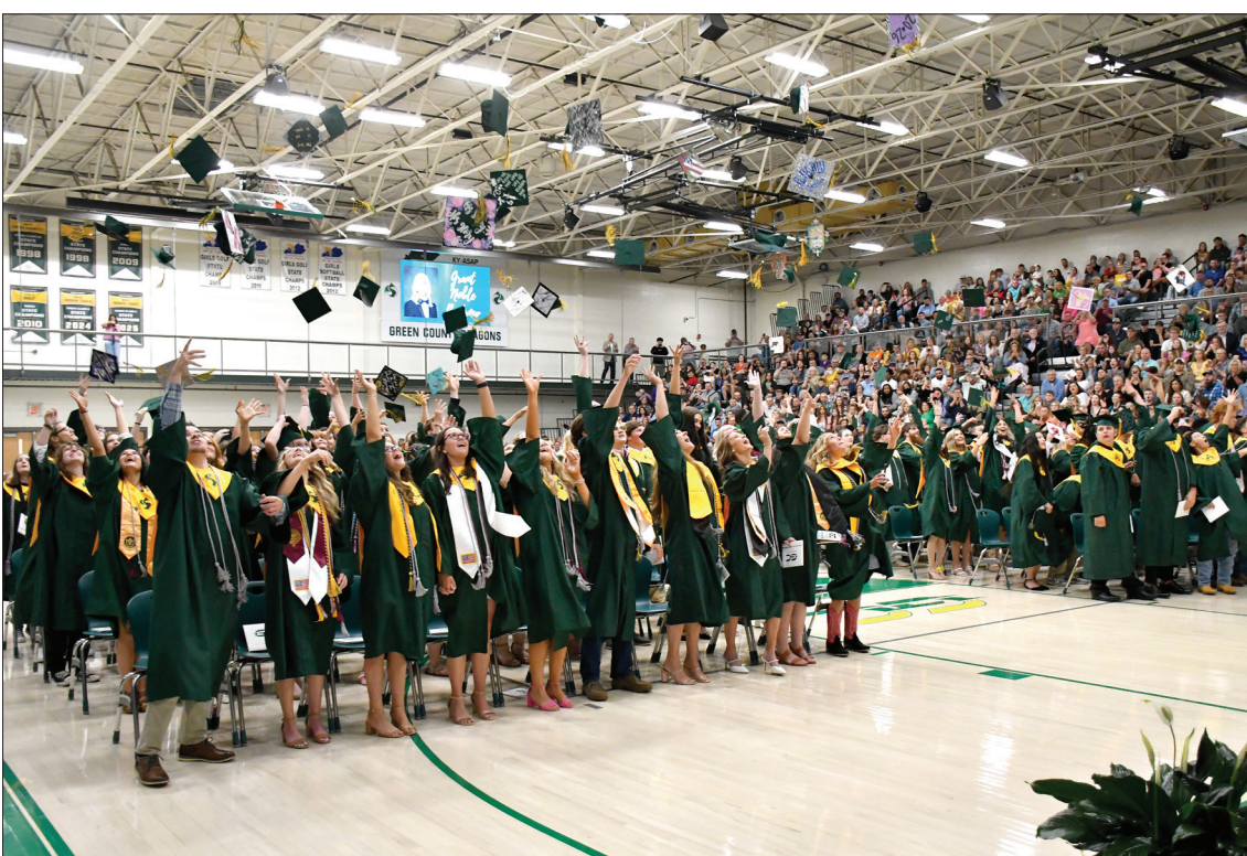
Seniors tossed their caps into the air at the end of the graduation ceremony Friday night at Green County High School. More graduation event photos are spread throughout this edition.