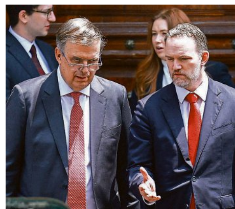
U.S. Trade Representative Jamieson Greer, right, said "the failure of our most important trading partners to address the importation of goods made with forced labor is unacceptable."

"It doesn't make sense if the object of this is to enhance controls on modern slavery," he said.