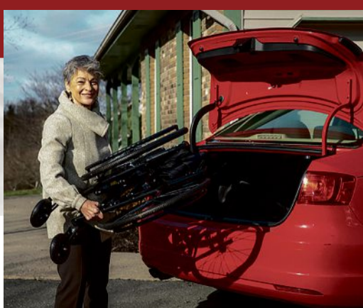
Easy to Transport and Store