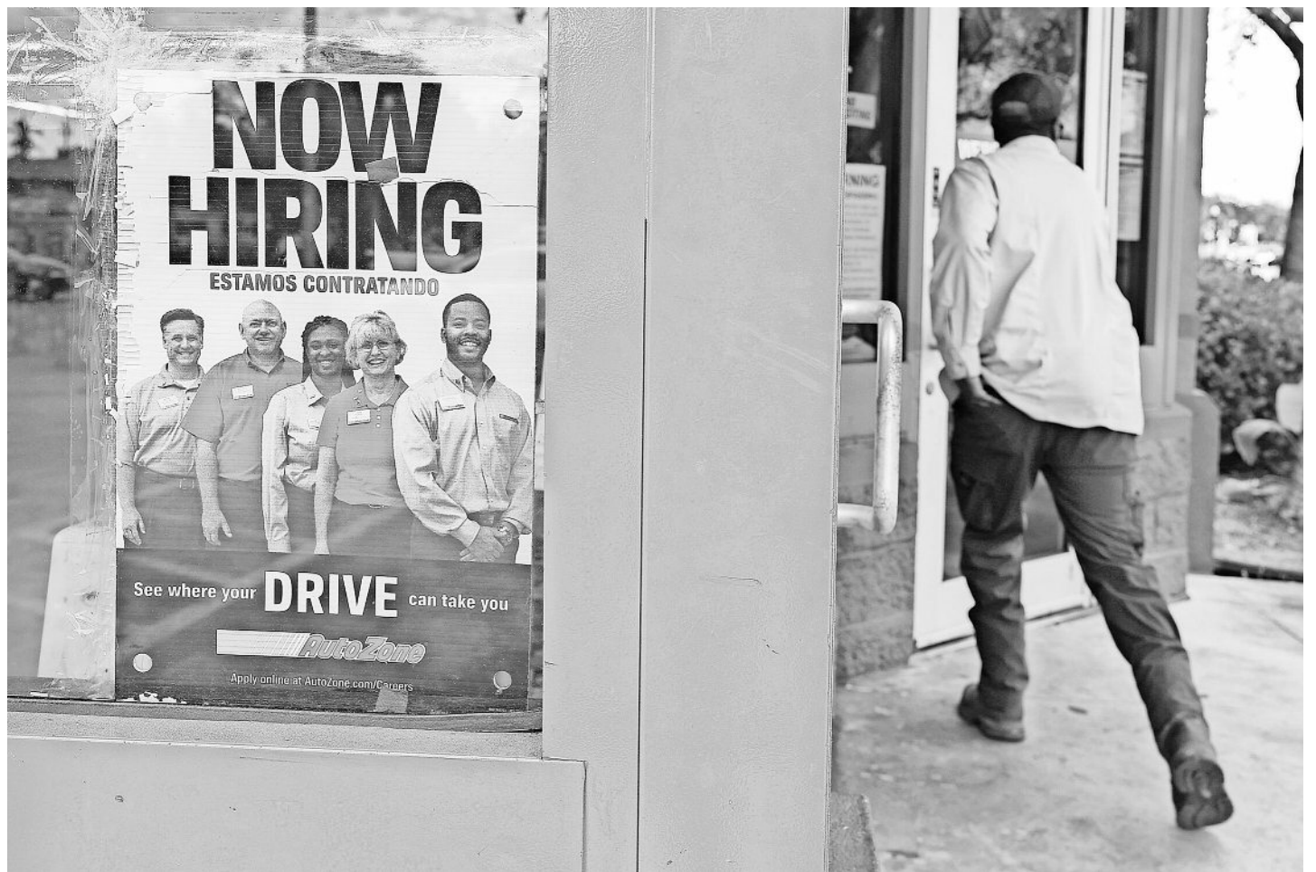
Private employment rose by 109,000 jobs last month, the biggest increase since January 2025.

The ADP report is jointly developed with the Stanford Digital Economy Lab, and was published ahead of the Bureau of Labor Statistics' more comprehensive and closely watched employment report for April on May 1. It, however, has been a poor predictor of the private