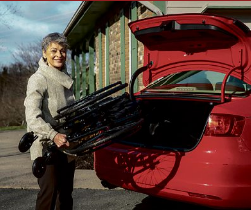
Easy to Transport and Store