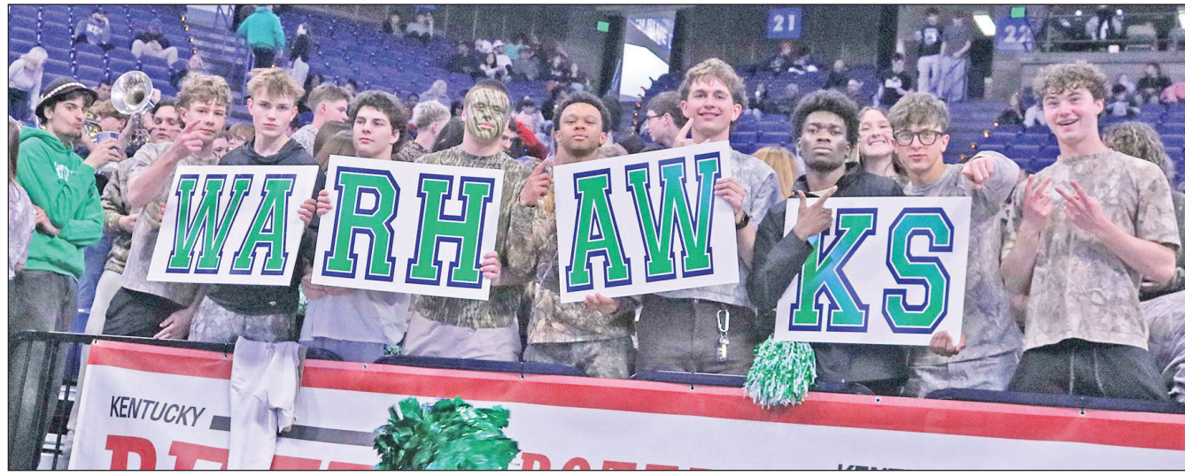
Great Crossing students hold placards while they root on the Warhawks at the Sweet 16 opener at Rupp Arena Wednesday night.

For full coverage of Wednesday's win, please see the sports section 11A.