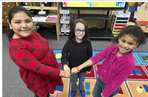
RISEING READERS – Pictured are South Fulton Elementary School students who recently reached Rising Reader certification level.