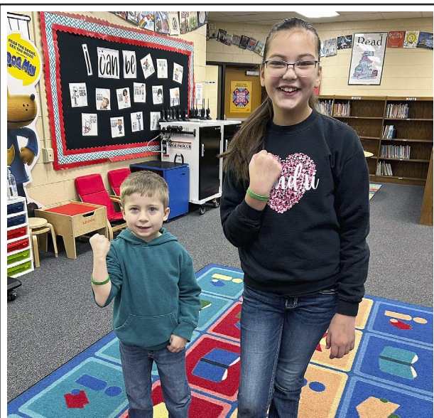
SUPER READERS – Pictured are South Fulton Elementary School students who recently reached Super Reader certification level.