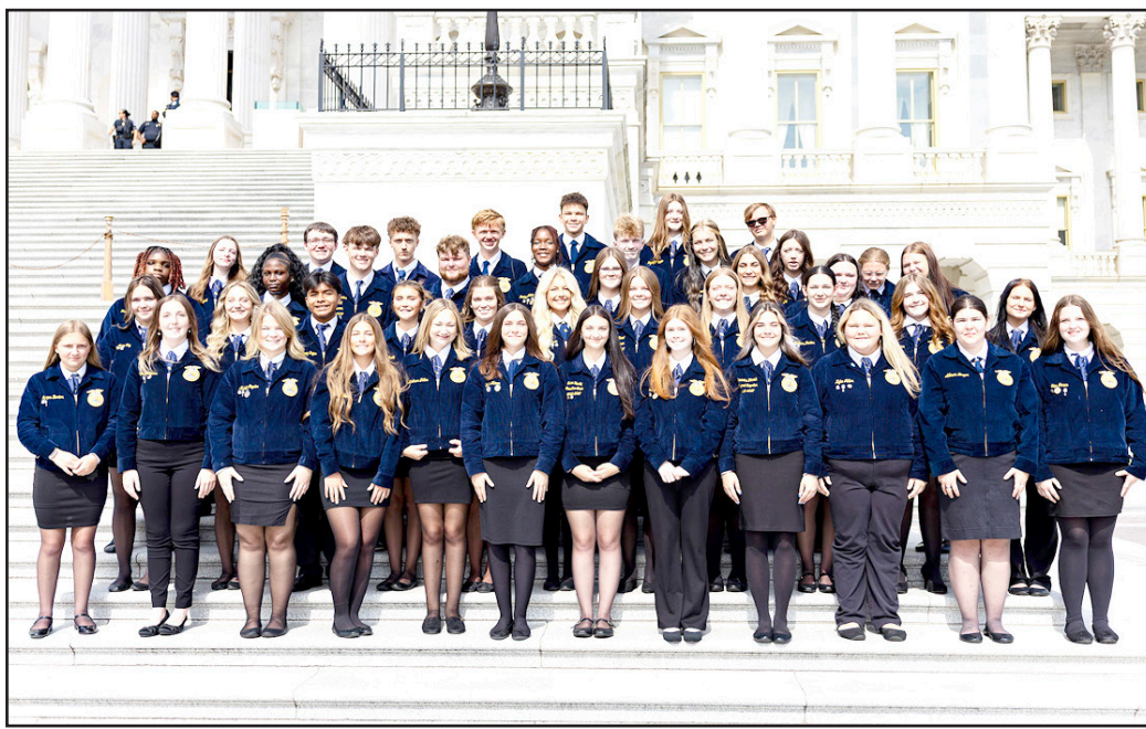
Elliott County FFA members in Washington, D.C.

Thank You For Reading The Elliott Co. News