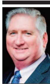
Perry Newcom County Judge Votes 872 | 46%