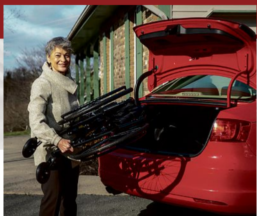
Easy to Transport and Store

It's so light weight that it's no problem to lift in and out of the back of my car. It's also easy to set up and collapse down. It is very compact and the wheels come off for compact packing alongside luggage or groceries etc. My Mom finds it very comfortable to ride in as well and enjoys the look. We both love it.