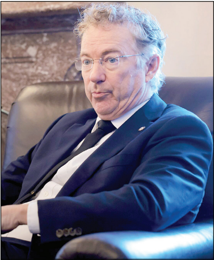
U.S. Sen. Rand Paul, R-Ky., speaks to reporters alongside U.S. Sen. Tim Kaine, D-Va., during a pen and pad meeting with reporters at the U.S. Capitol on Jan. 7, 2026 in Washington, D.C.

subject,” he posted on Truth Social. Thursday’s vote advanced the legislation over a procedural hurdle to discharge the bill from committee. The bill still requires additional Senate debate and votes before it would head to the House. The vote came days after U.S. special forces launched a surprise overnight attack on Venezuela’s capital of Caracas on Saturday, capturing the country’s president, Nicolás Maduro, and his wife, Cilia Flores. The couple appeared in federal court Monday on federal drug and conspiracy charges. Venezuelan Interior Minister Diosdado Cabello claimed Wednesday that more than 100 were killed in the raid, according to numerous media outlets that posted a video of his statement.