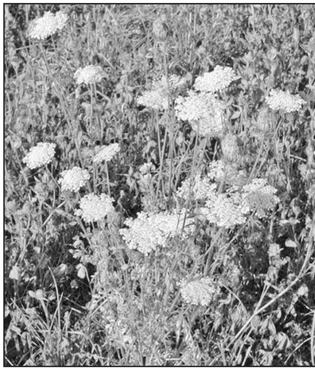
Queen Anne's Lace

They share not only their height, but both are also crowned with broad white flower heads made up of hundreds of individual fleurettes, though his flower head is domed while hers is rather flat, and in the center of the Queen's flower sits a small dark jewel, befit-