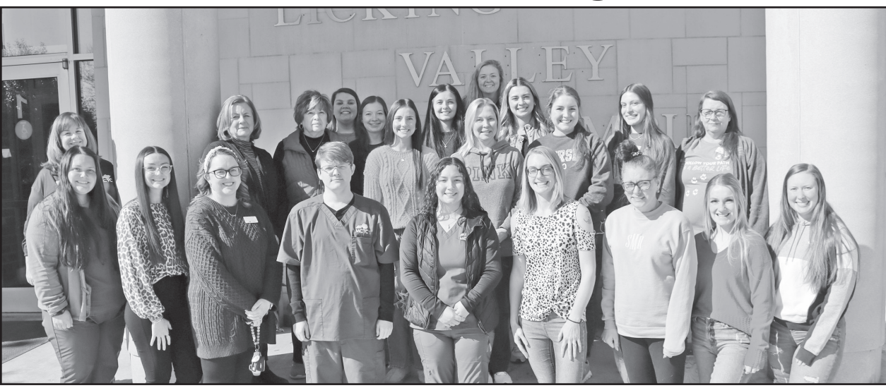
Shown are MCTC nursing instructors and students.