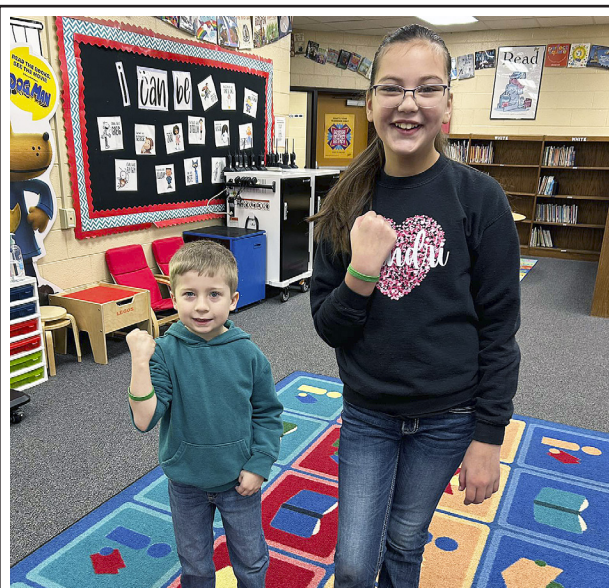
SUPER READERS – Pictured are South Fulton Elementary School students who recently reached Super Reader certification level.