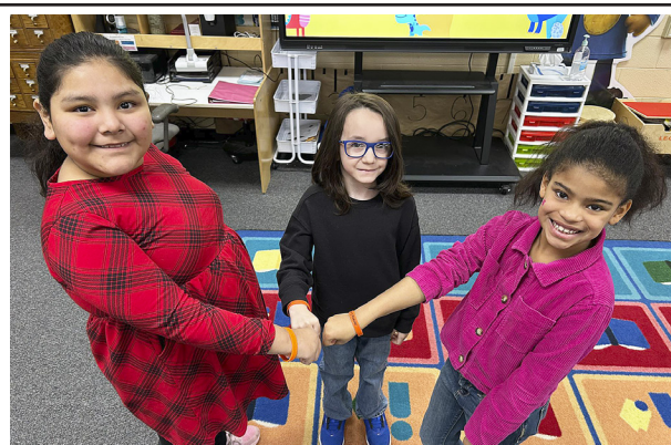
RISEING READERS – Pictured are South Fulton Elementary School students who recently reached Rising Reader certification level. (Photo submitted)