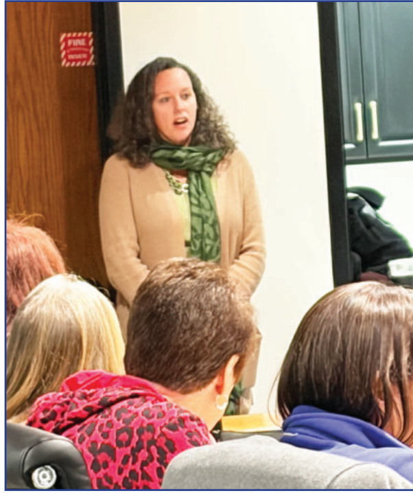
▲ Alana Brummett | BCP Photo