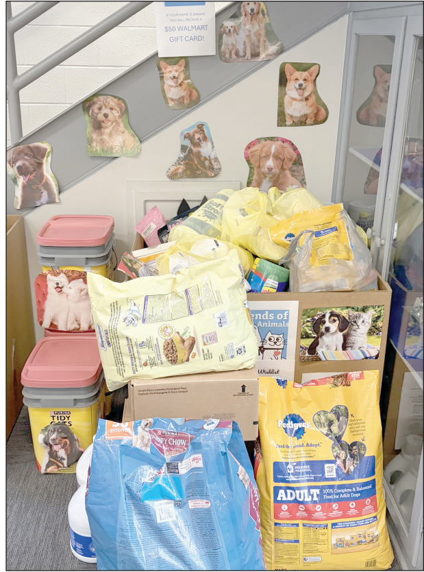
Butler Co Animal Shelter box.