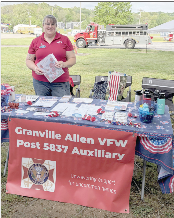
Granville Allen VFW

power of collaboration, and stronger Butler County, helping build a healthier, safer,