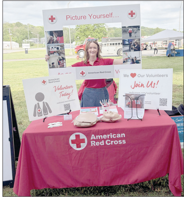
American Red Cross