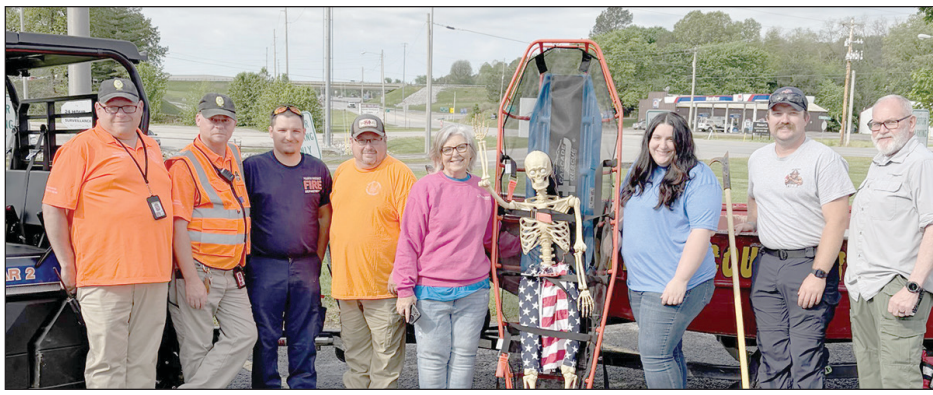
Butler Co Rescue and Casco employees.

to monetary contributions, thousands of items were purchased, donated, and distributed among the participating nonprofit organizations, further extending the impact of the week's efforts.