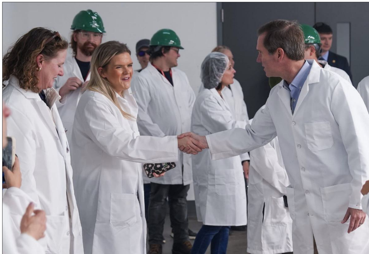
GOV. ANDY BESHEAR'S OFFICIAL SOCIAL MEDIA PAGE

Tier 1 is the smallest of Kentucky's cultivator license categories. Tier 1 growers are capped at