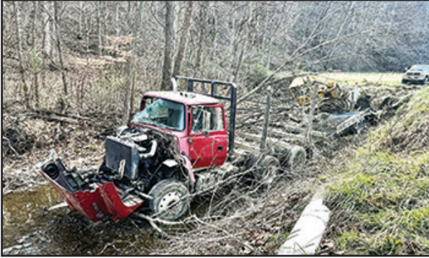
A dozer was severely damaged after it rolled off a trailer during a crash on Highway 205 on Christmas Eve.

Traffic was slowed on Highway 205 near Mudlick Road after a single-vehicle commercial vehicle crash on Christmas Eve. Vehicles passing the scene reported the crash at 2:30 on Wednesday afternoon after a truck, trailer, and bulldozer left the roadway and ended up in the creek. Drivers in the area reported that a red Ford L9000 and its trailer had “remained connected” and were still upright in the creek bed. The truck sustained damage after striking several trees along the creek bed before coming to a stop. The John Deere 450G Turbocharged Crawler bulldozer did not fare so well and was severely damaged after it left the trailer and rolled over at least once in the small field near the crash site. The cab of the dozer received severe damage. The sharp curve has been the scene of numerous accidents in the past. Officials from the Kentucky Department of Transportation are currently planning to straighten and improve the roadway as part of the next round of improvements to Highway 205. Information at the scene indicated that it was owned by Napier Logging of Highway 205. Ambulance crews were dispatched to the crash site, but the driver refused treatment or transport. The vehicle, the trailer, and the dozer were removed from the stream.