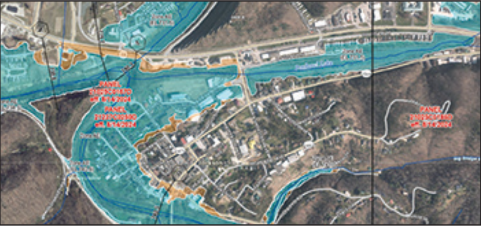
Property buyouts started as Breathitt County and the surrounding areas.

The Breathitt County Bobcats are embarking on a thrilling journey to Rupp Arena for the Sweet Sixteen Tournament. Before setting off, they paraded through town, greeted by a sea of enthusiastic supporters cheering them on. Jackson City School even encouraged its students to step outside and rally behind the team, embodying the spirit of community and pride that makes this moment truly special. The Bobcats play North Laurel Thursday, 11 a.m. at Rupp Arena.