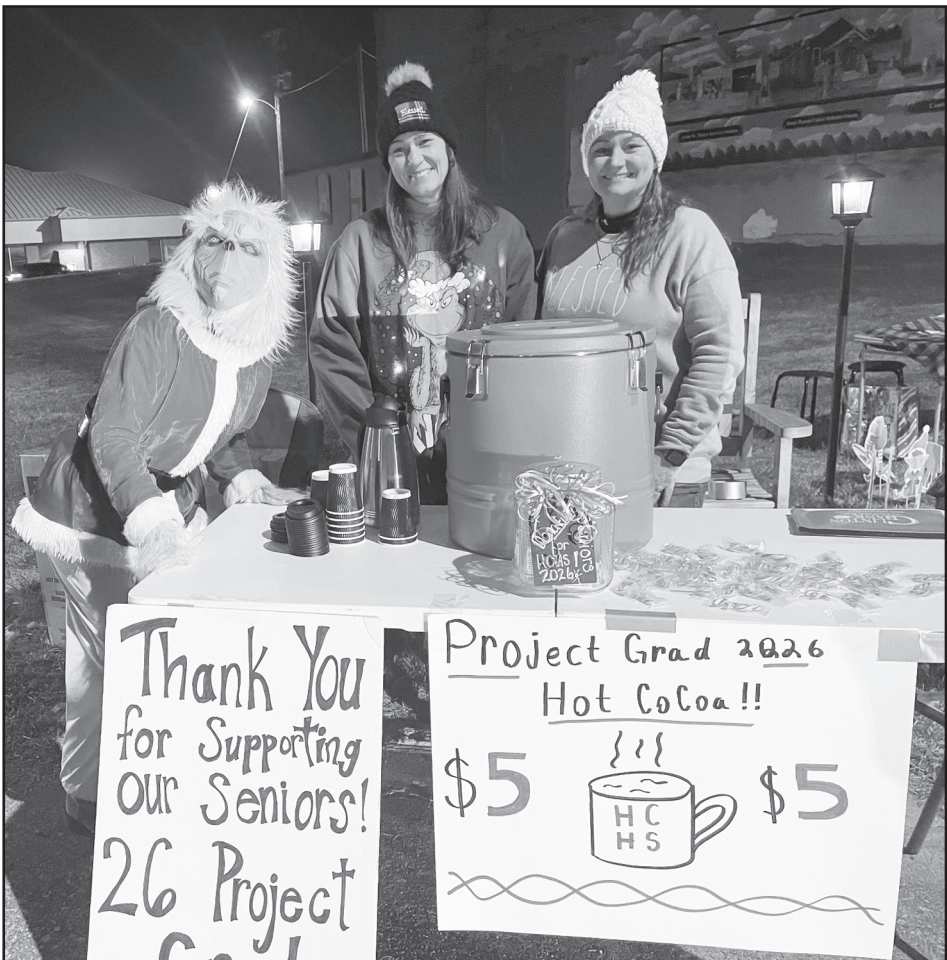
Even the Grouchy Grinch stopped by the Project Graduation hot cocoa fundraiser Saturday night at the Chamber’s Hickman County Parade!

Ray's Backhoe Service Septic Systems Installed Certified Installer Backhoe Work Gravel & Dirt Hauling & Driveway Work FREE ESTIMATES 254-0401 254-0475