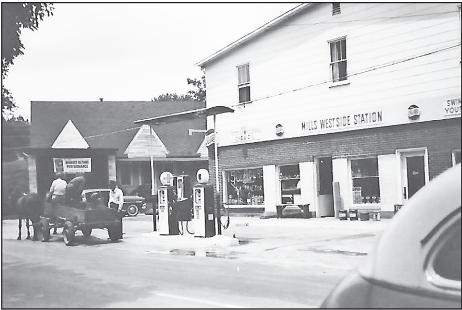
Mills Westside Station, Clinton, Ky.