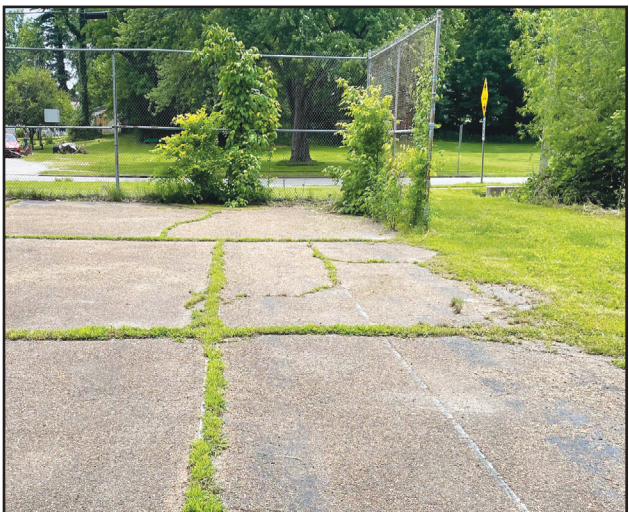
The current concrete pad of the former tennis court will be removed and a new pickleball court installed if the grant application is approved.