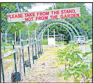
Turnip greens were some of the latest free for the taking items at the Golden Gardens vegetable stand.