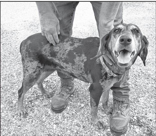
Is anyone missing this sweet dog in the Columbus area? Call the Times office at 270-653-4040.