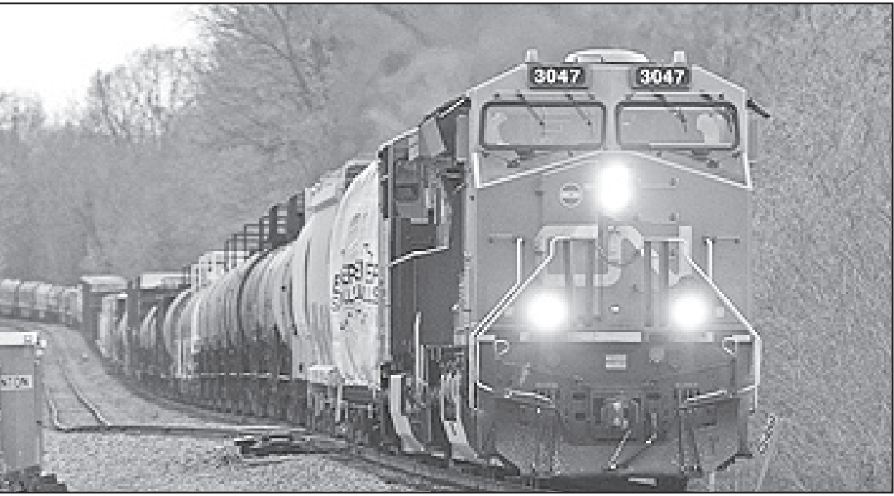
Northbound out of Clinton and Arlington bound on a cloudy spring morning.