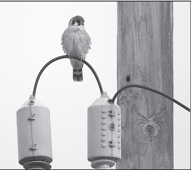
"Nothing to see here. I'm just an insulator." American Kestrel on a utility pole in Arlington.