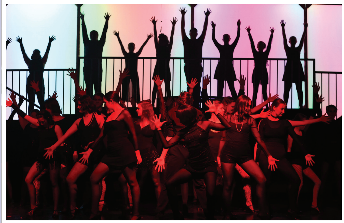
The cast of "Chicago" rehearses leading up to their performance at George Rogers Clark High School.