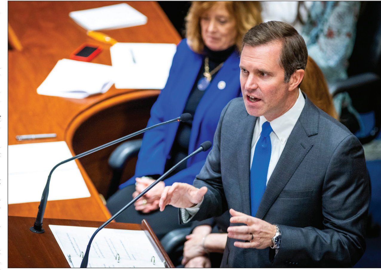
Gov. Andy Beshear appeared before a joint session of the House and Senate on Jan. 8, 2025 to deliver his State of the Commonwealth address.

Beshear's letter to lawmakers also said they had failed to take into account the costs of their deci- Beshear said the legislasion to protect conversion therapy. House Bill