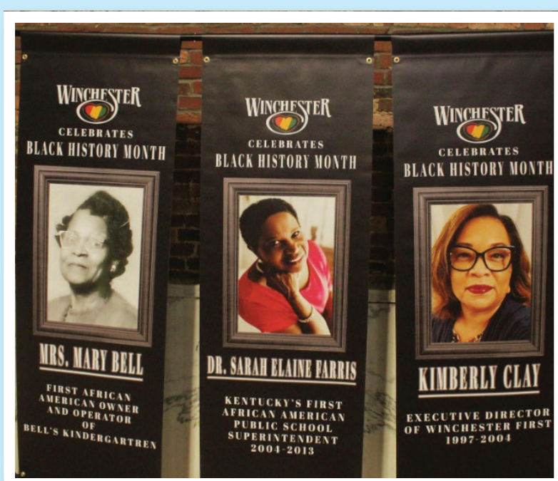
Banners 1