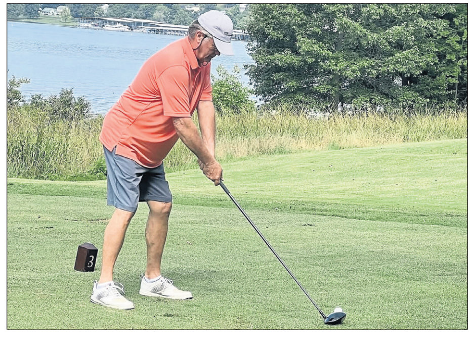
According to Greene, the payout for 1st place is $300, the payout for 2nd place is $200 and the payout for 3rd place is $100.