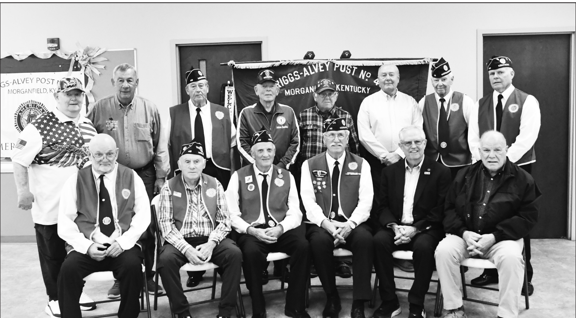
MANY OF THE county's Vietnam veteran were recognized Saturday evening at the annual Griggs-Alvey American Legion #48 Vietnam Veteran's Commemoration dinner. Pictured are several of the veterans who were in attendance.