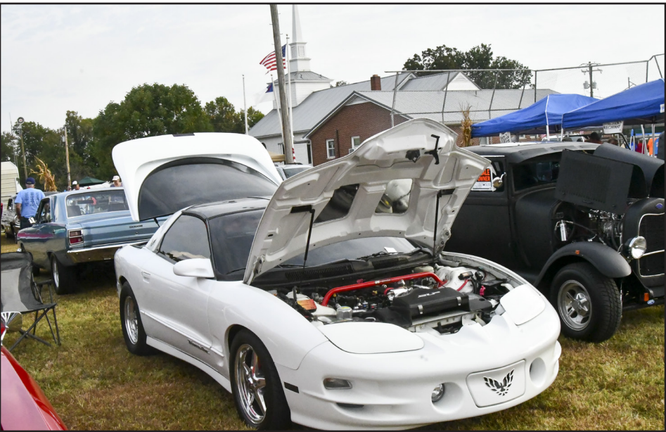
DOZENS OF VINTAGE cars and trucks were on display in Onton on Saturday evening during the car show which is held as a part of the annual Onton Hay Days celebration. Additional photos of Hay Days activities can be found in this week's paper.