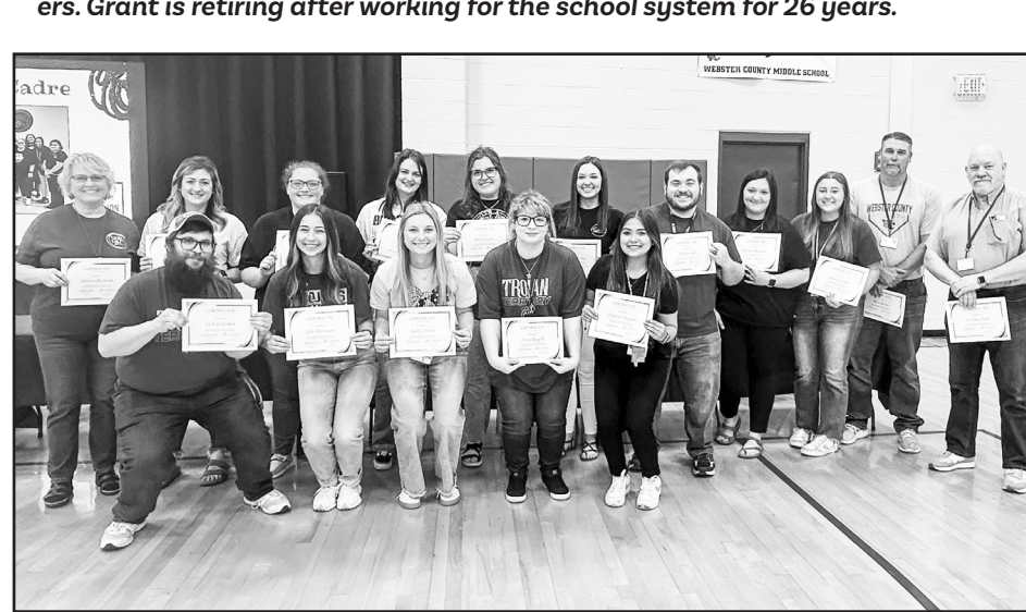
A ROUSING WELCOME was given for the new employee cadre. Those teachers and assistants spent the year "learning the ropes" and working to help make attending Webster County Schools the best possible experience. They endured many hours of training and work as they became part of the education experience.